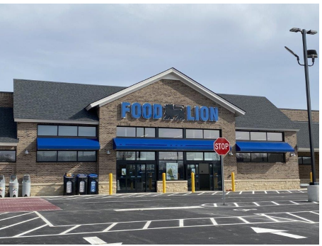
The new Kernersville, NC, Food Lion is located at 1014 N. Main St, Kernersville, NC 27284.

brand of wholesome and organic products made with no artificial flavors, preservatives or synthetic colors. Additionally, the store features a walk-in produce cooler, ensuring the freshest items available, and a self-service hot wing and Asian food bar.